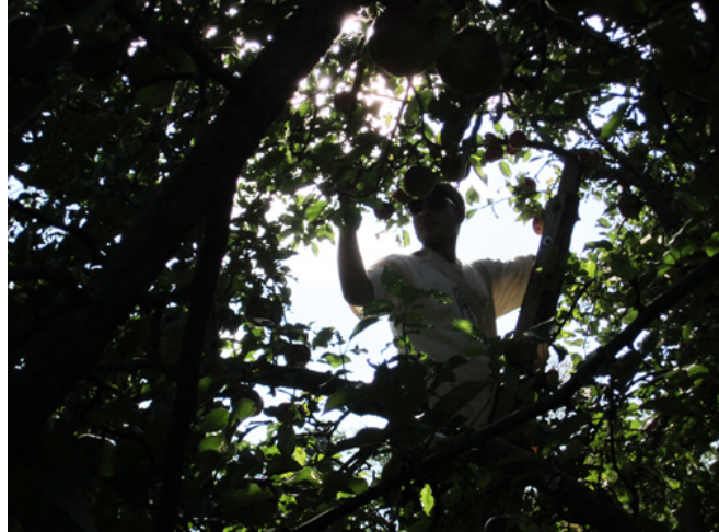
Rob picking Sweet Sixteen's for your CSA Share this week

We usually eat chestnut simply “out of hand,” although it is said to make an excellent sweet sauce. Regina used them in the apple pickle recipe that we included in the newsletter last week and thought they made the best batch yet – a strong recommendation since we make apple pickles a lot at Super Chilly Farm.